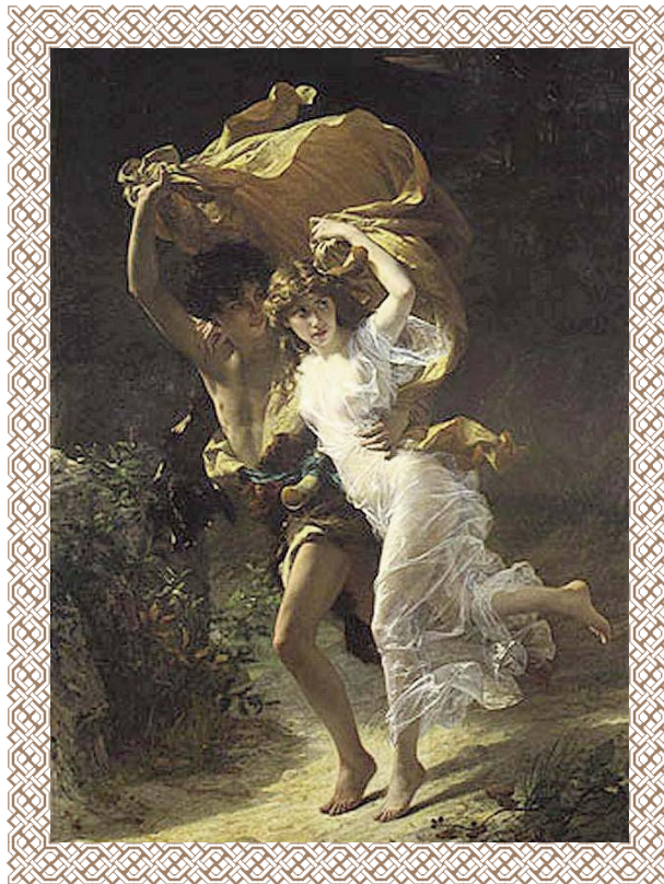
Pierre-Auguste Cot: The Storm (1880)

An International Psychoanalytic Conference