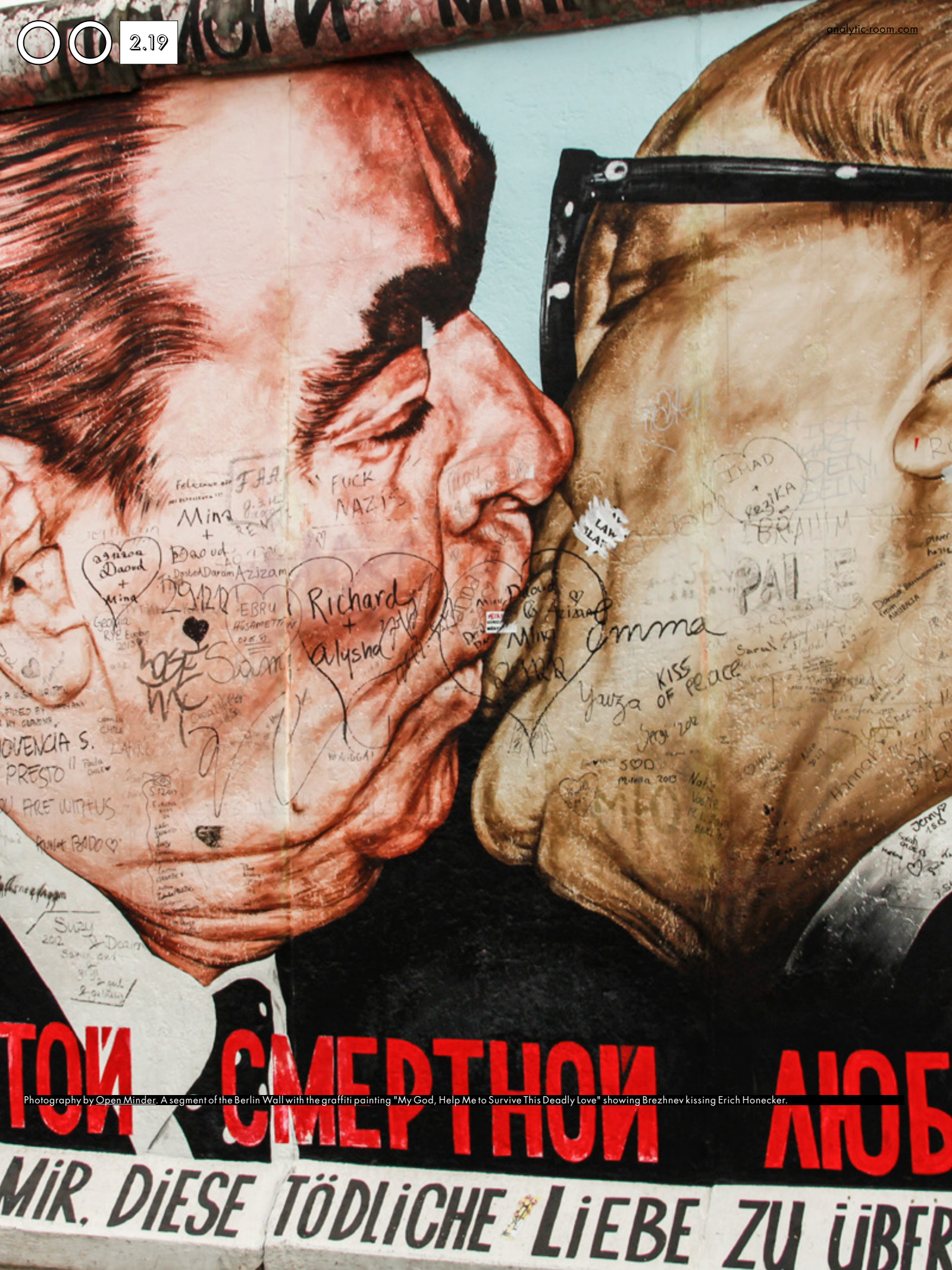
A segment of the Berlin Wall with the graffiti painting "My God, Help Me to Survive This Deadly Love" showing Brezhnev kissing Erich Honecker.

ТОЙ СМЕРТНОЙ ЛЮБ MIR, DIESE TÖDLICHE LIEBE ZU ÜBER