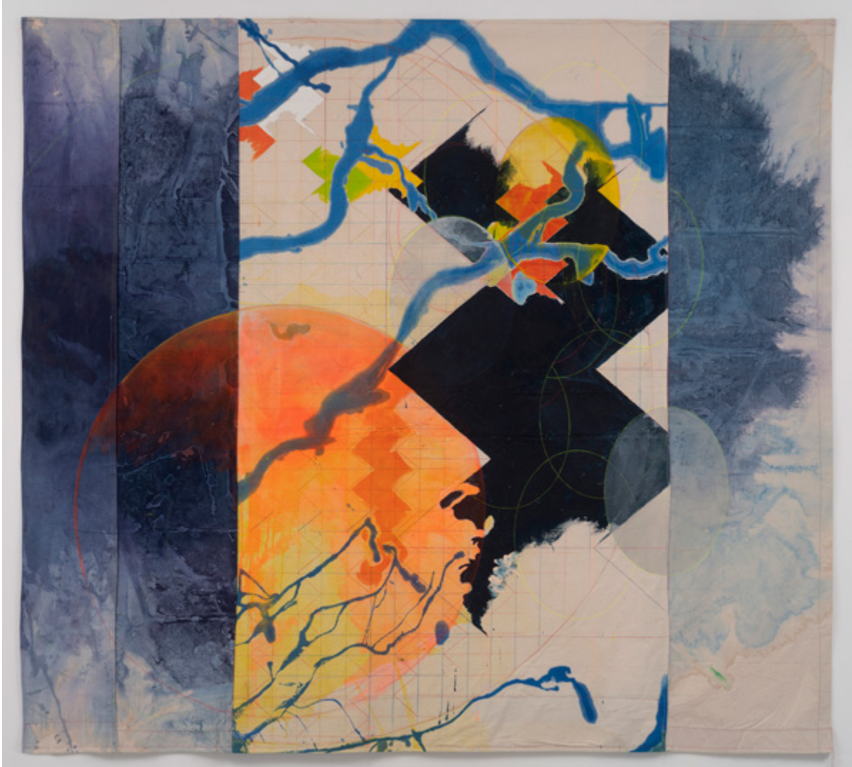
Anne Sherwood Pundyk, "Being Blue," 2018, 90 x 100 inches, Latex, Acrylic, Colored Pencil, and Stitching on Canvas.