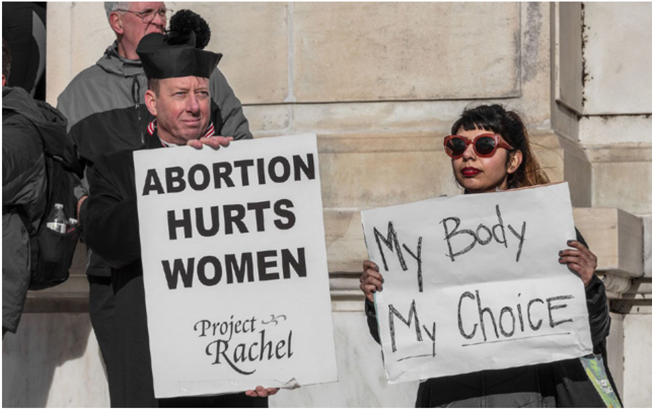
March for Life, Washington, DC.