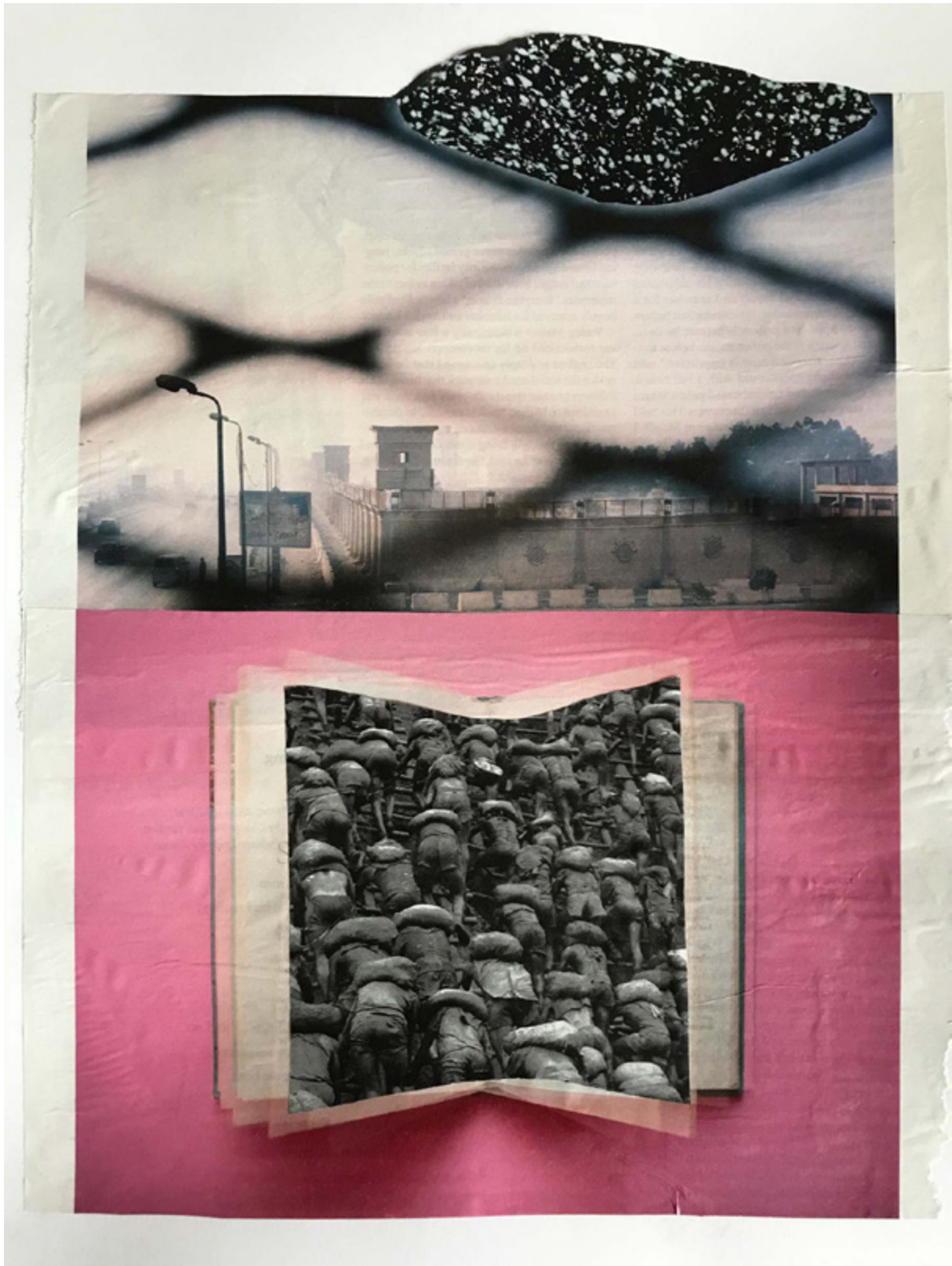
Collage by Leah Lipton.